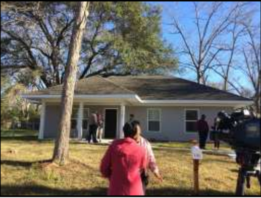
Dedication Day for the Habitat for Humanity home in Garden City.